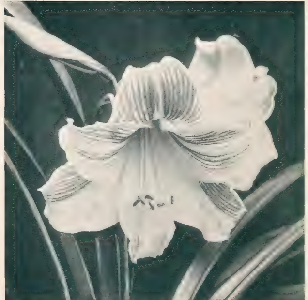
Beckert's Superb Hybrid Amaryllis

on strong, stiff stems 8 to 12 inches long. $1.00 doz., $7.00 per 100.